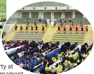
Welcome party at the 2019 tournament

George Watson's College Bagpipe Band has been visiting the tournament every year since 2003. The school is located in the Scottish capital of Edinburgh, to the south of city center. It is a fully integrated school with students ranging from Nursery through to Senior 6, accommodated on a single campus. The school's pipe band has been the winner of the Scottish Schools Pipe Band Championships, from 2015 to 2018.