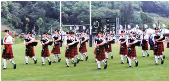
The 2002 tournament