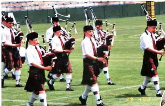
The 2003 tournament

George Watson's College Bagpipe Band has been visiting the tournament every year since 2003. The school is located in the Scottish capital of Edinburgh, to the south of city center. It is a fully integrated school with students ranging from Nursery through to Senior 6, accommodated on a single campus. The school's pipe band has been the winner of the Scottish Schools Pipe Band Championships, from 2015 to 2018.