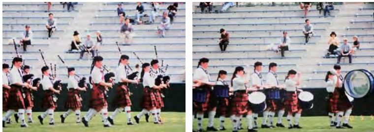
The 2000 tournament