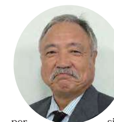
President Japan Rugby Football Union

I sincerely hope that players involved in this tournament will make their way to become representatives of their countries, to play vigorously in international competitions. Furthermore, I pray this tournament will always be a flourishing environment for young Japanese players, who will one day evolve into world class athletes, to lead our future rugby society.