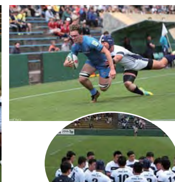
National anthems of the two teams were played before the opening match. Exeter College (England) v. Osaka Toin High School