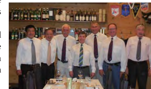
At the 2015 tournament

Thank you for another fantastic event enjoyed by all.