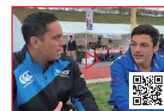
Waverley College (Australia)