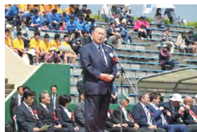
2014 (13th tournament)