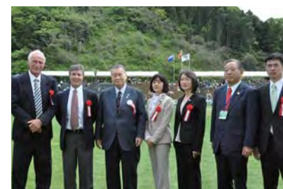
2015 (14th tournament)