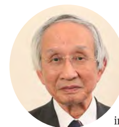
Honorary President Japan Rugby Football Union