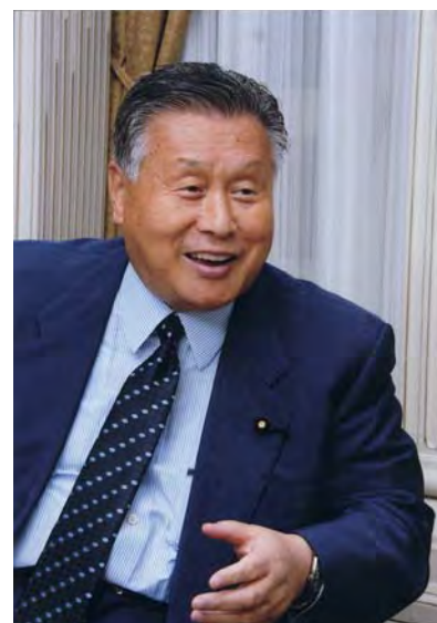
Former Honorary President Japan Rugby Football Union