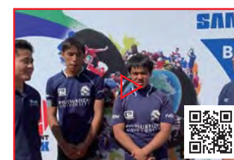
Ryutsu Keizai University Kashiwa High School (Chiba, Japan)