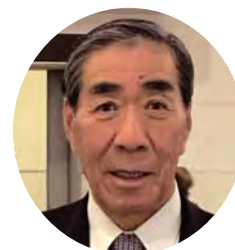
Former Managing Director SANIX SPORTS FOUNDATION

I am more than glad if this tournament is of any assistance in providing young players with dreams and hopes for the future, as well as chances to view the wide world. I would like more people to interact through rugby, and to come to the tournament to watch exciting matches. My staff and I shall make every effort in continuing this event for many years to come. We humbly ask all those concerned to support us, as you have done in previous years.