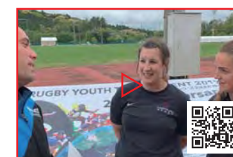
Hartputy College (England) Coaches