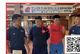
Osaka Toin High School (Osaka, Japan)