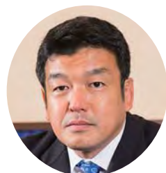
President SANIX INCORPORATED