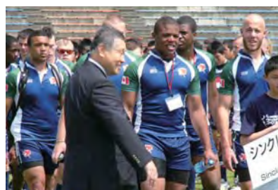
2008 (7th tournament)